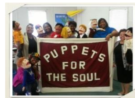
Cedar Grove Church Puppet Ministry And Dance Ministry