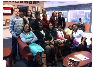
DCYM at Kindred Rehabilitation for Old Christmas Service - January 2014