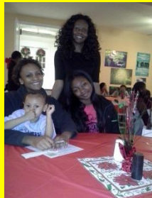
DCYM at Annual Christmas Social - Dec 2013