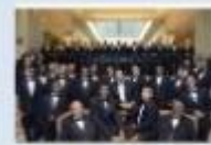
100 Men in Black Durham NC