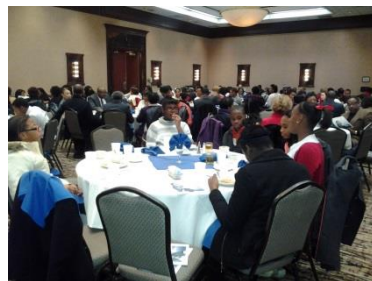
DCYM at MLK Banquet - January 2014