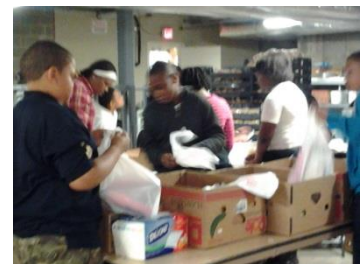
DCYM at Rescue Mission Easter Party - April 2014