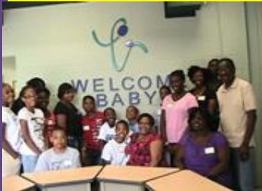
DCYM at Welcome Baby - July 2013