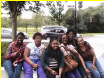
DCYM Leaders at Lott Carey Foreign Missions Convention in Washington DC- August 2013