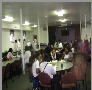
Senior Missionaries Serving