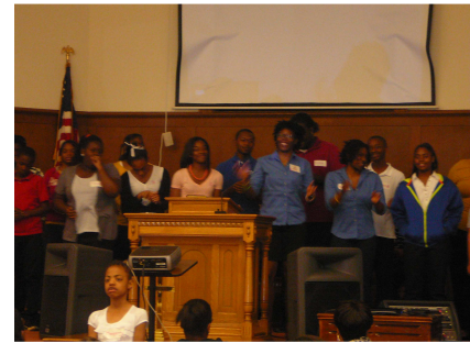
Henderson Grove Missionary Baptist Church Youth Choir